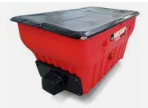
ALL WEATHER COVER WITH STURDY FRAME FOR EASY UNCOVERING