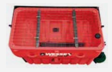
MESH TOPSCREEN GRID – PREVENTS LARGE CHUNKS ENTERING THE HOPPER