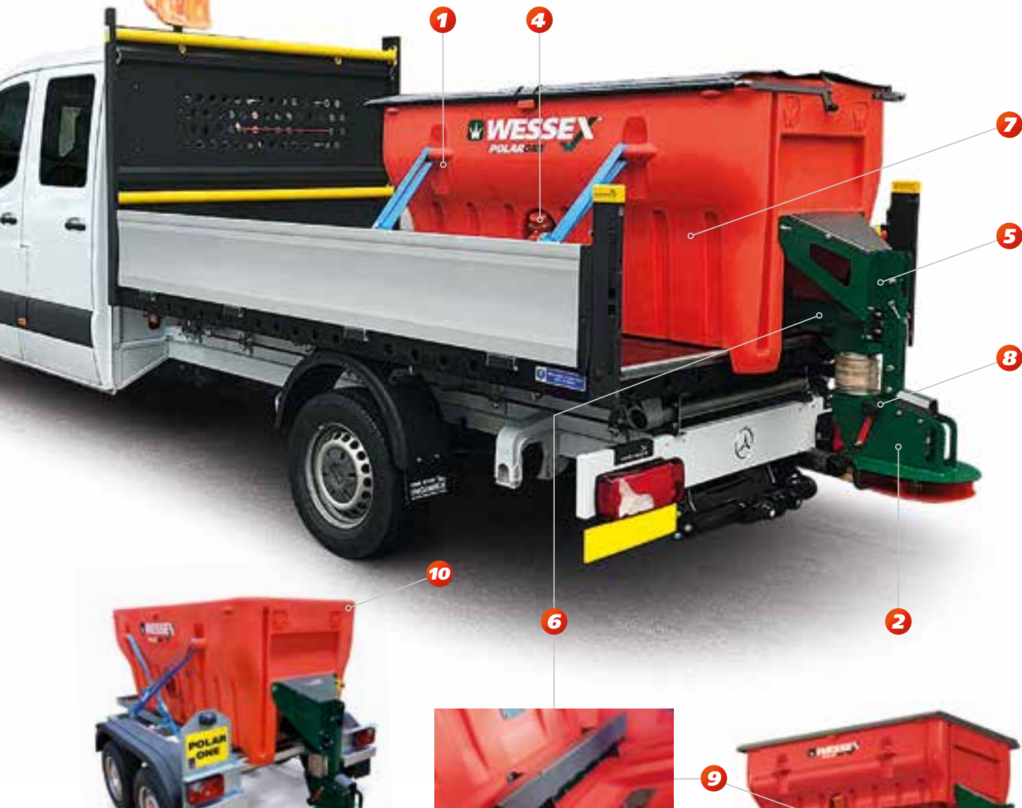
TRAILER - OPTIONAL EXTRA