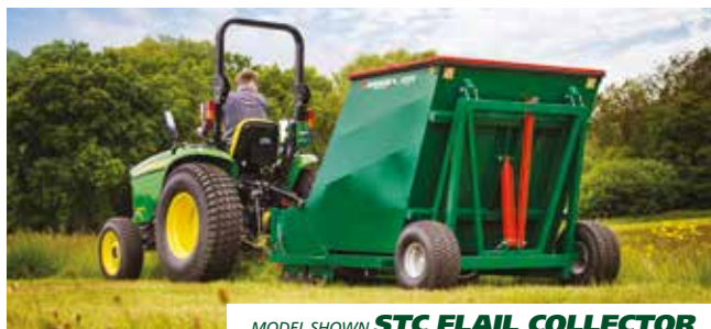
MODEL SHOWN STC FLAIL COLLECTOR