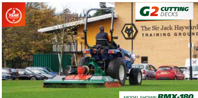
MODEL SHOWN RMX-180