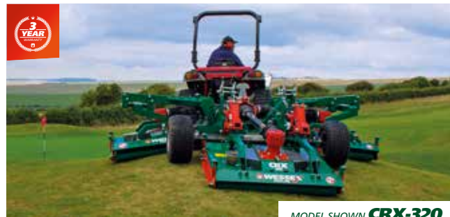
MODEL SHOWN CRX-320