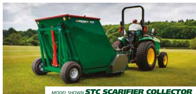
MODEL SHOWN STC SCARIFIER COLLECTOR