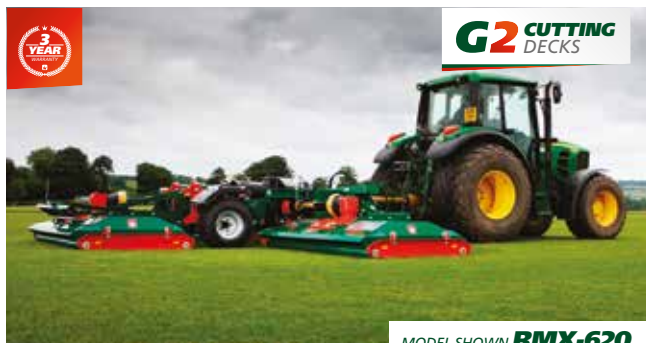
MODEL SHOWN RMX-620

RMX-620 Hydraulically folding tri-deck 6.2m £31,950