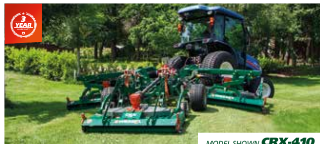
MODEL SHOWN CRX-410

Please specify when ordering which format is required.