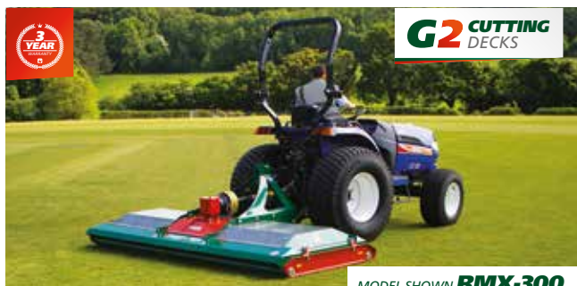
MODEL SHOWN RMX-300