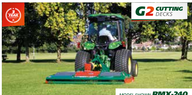
MODEL SHOWN RMX-240