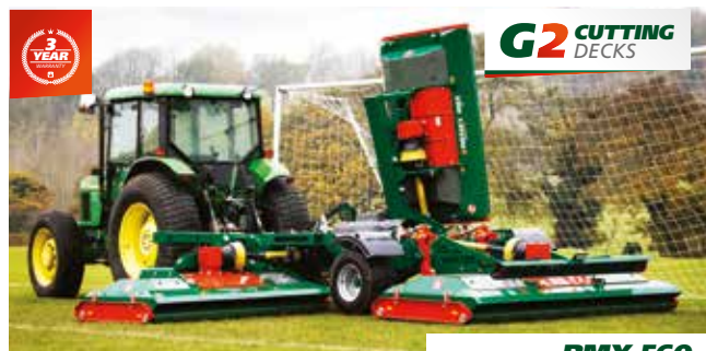
MODEL SHOWN RMX-560

RMX-500 Hydraulically folding tri-deck 5.0m £29,950