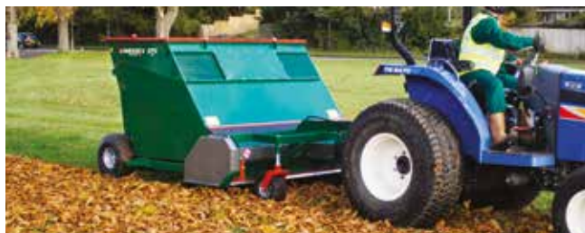
MODEL SHOWN STC SWEEPER COLLECTOR