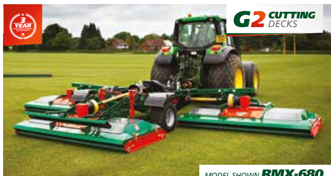
MODEL SHOWN RMX-680

RMX-620 Hydraulically folding tri-deck 6.2m £31,950