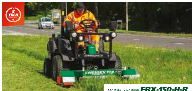
MODEL SHOWN FRX-150-H-R