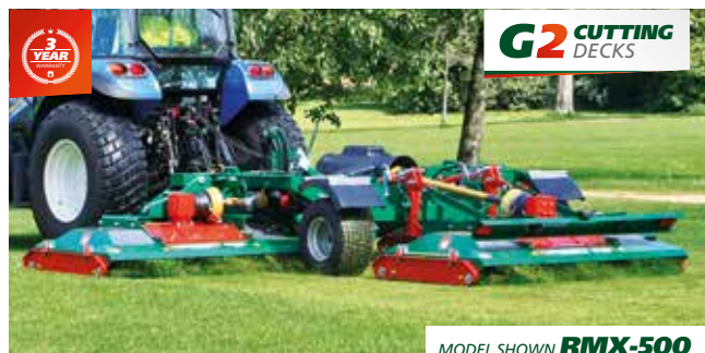
MODEL SHOWN RMX-500

RMX-500 Hydraulically folding tri-deck 5.0m £29,950