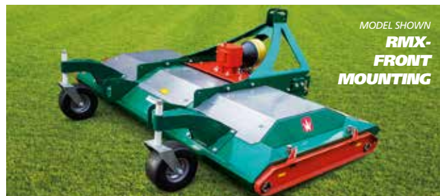
MODEL SHOWN RMX-FRONT MOUNTING