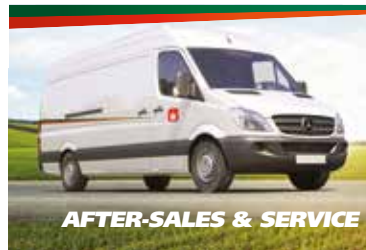
AFTER-SALES & SERVICE