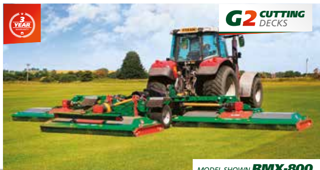
MODEL SHOWN RMX-800

RMX-680 Hydraulically folding tri-deck 6.8m £34,500