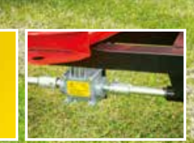
GEARBOX WITH SPINNER DISENGAGEMENT

Ideal for collecting autumn leaves, grass clippings and scarifying debris etc, the MTC-120-E is an effective sweeper that can be towed behind an ATV, utility vehicle, garden tractor or 4x4.