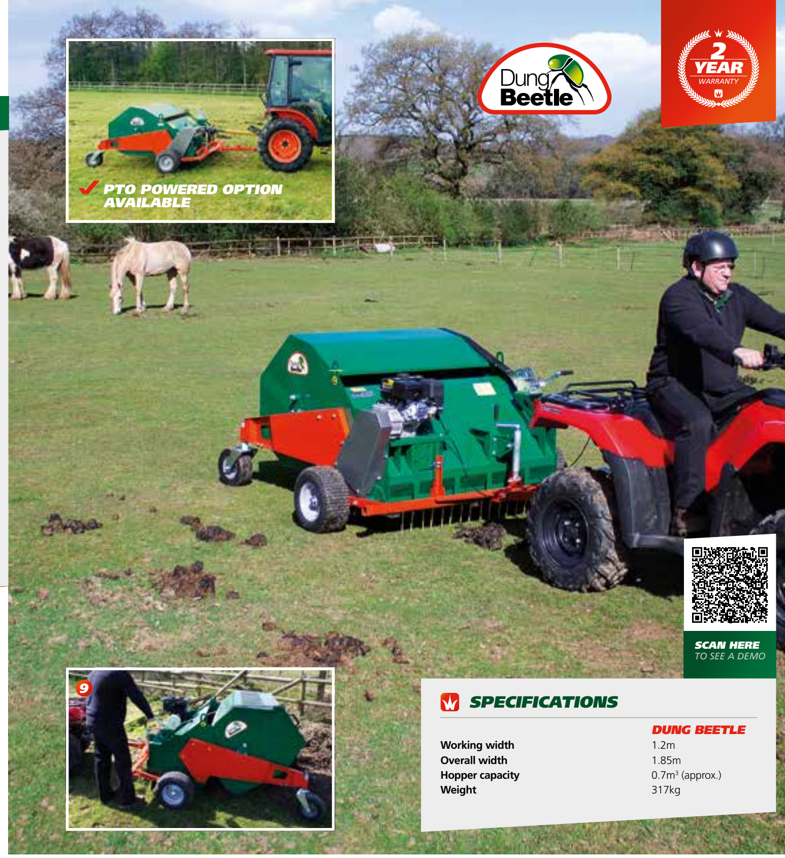
SPRINGTIME SWEEPING WILL COLLECT DEAD GRASS, MOSS AND OTHER