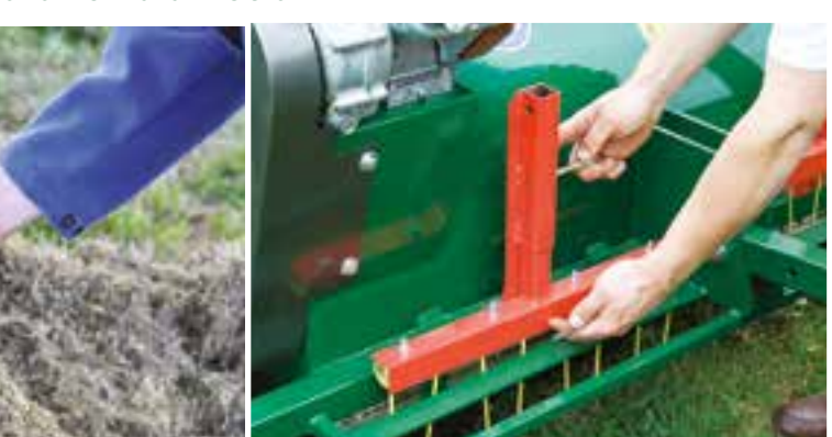
NO MUCK, NO WORMS