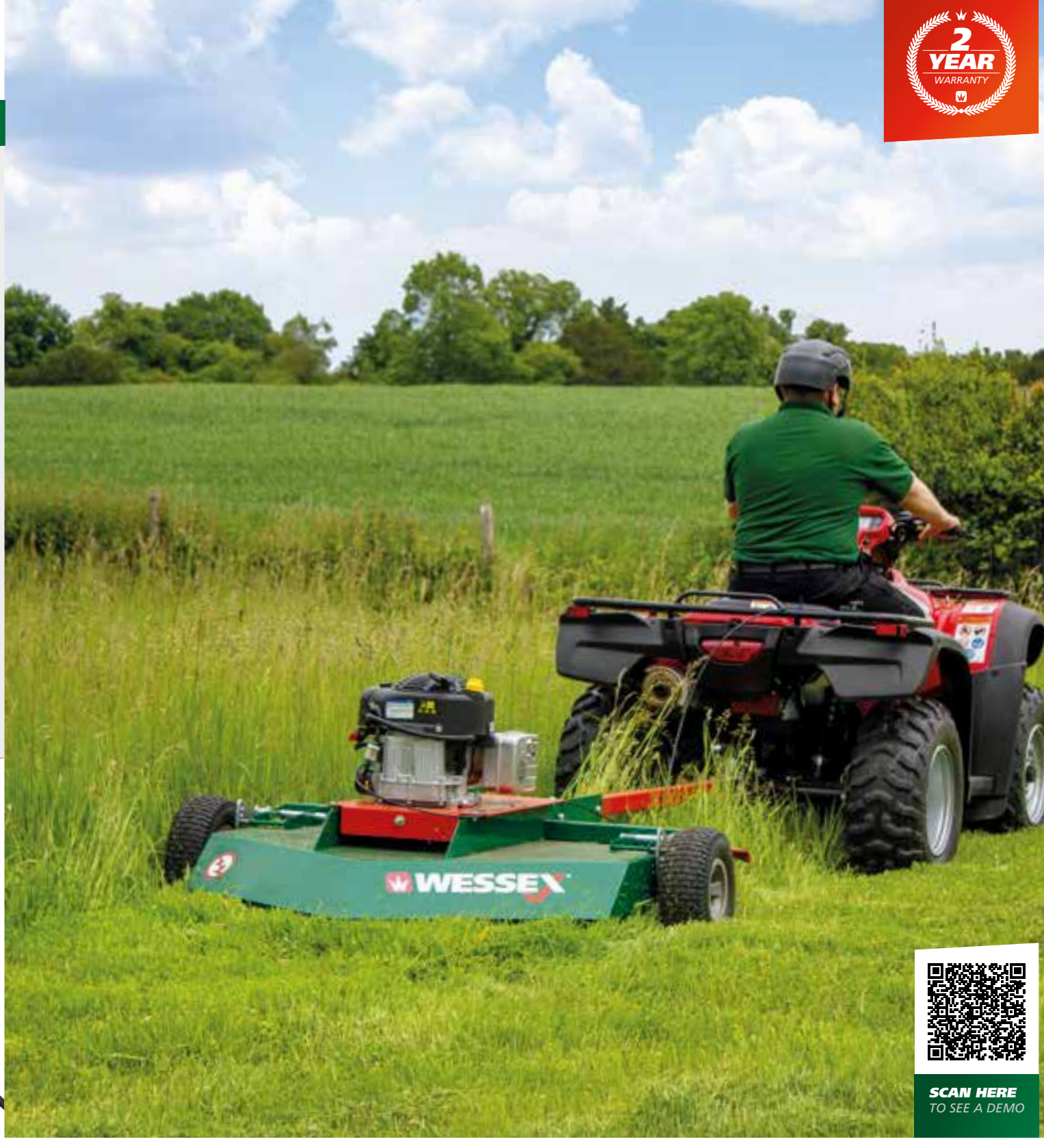
SIMPLE HEIGHT ADJUSTMENT