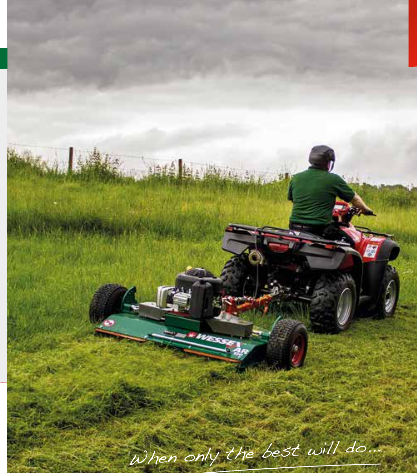
HEIGHT OF CUT IS SET BY REPOSITIONING THE WHEELS BY MEANS OF A SPRING LOADED PIN MECHANISM ON THE WHEEL BRACKETS