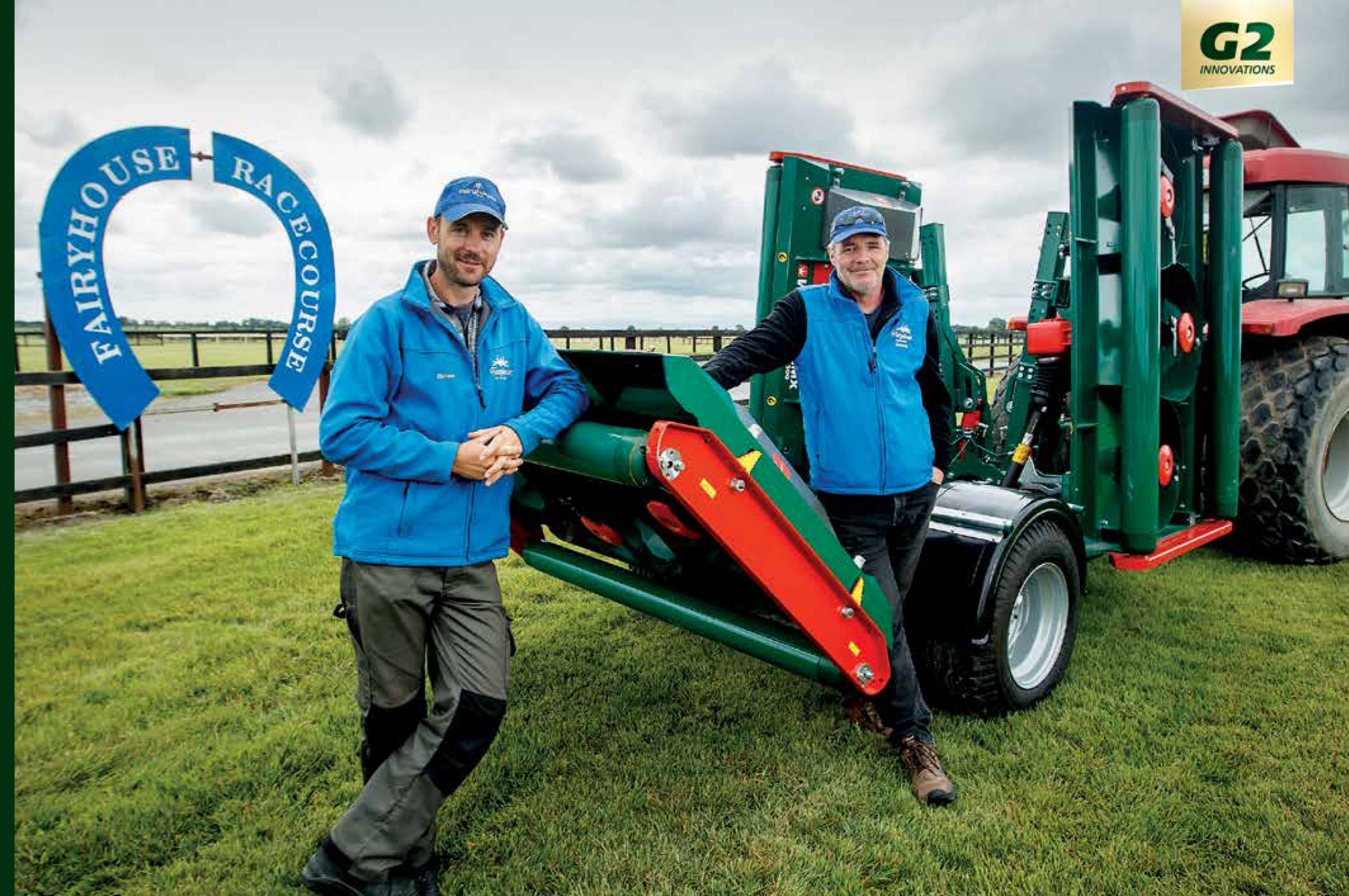
MODEL SHOWN RMX-500 FAIRYHOUSE RACECOURSE IRELAND. HOME OF THE IRISH GRAND NATIONAL